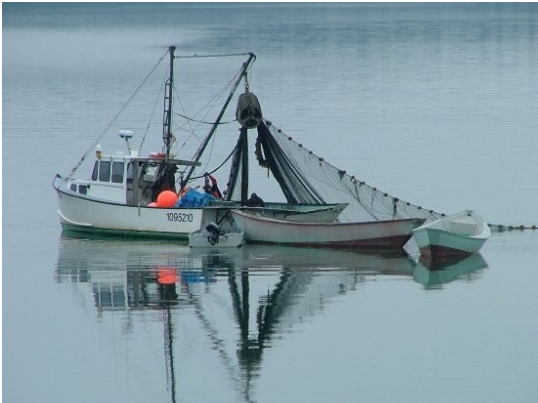
You might see fishing out front