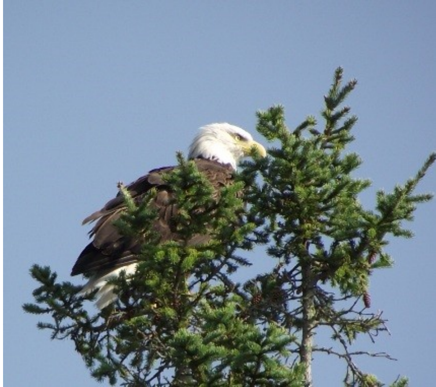
Eagles like our spruce trees