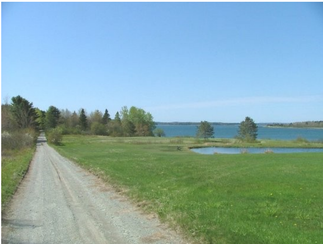
Our 1/4 mile long driveway means no road noise