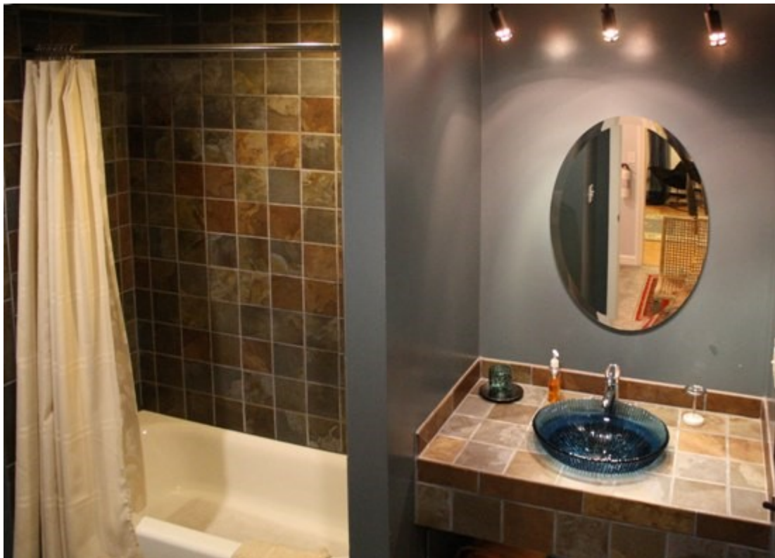
Big bathroom, plenty of towels