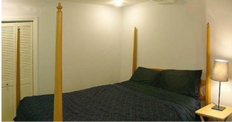
Bedroom two of two. There's an inflatable mattress too.