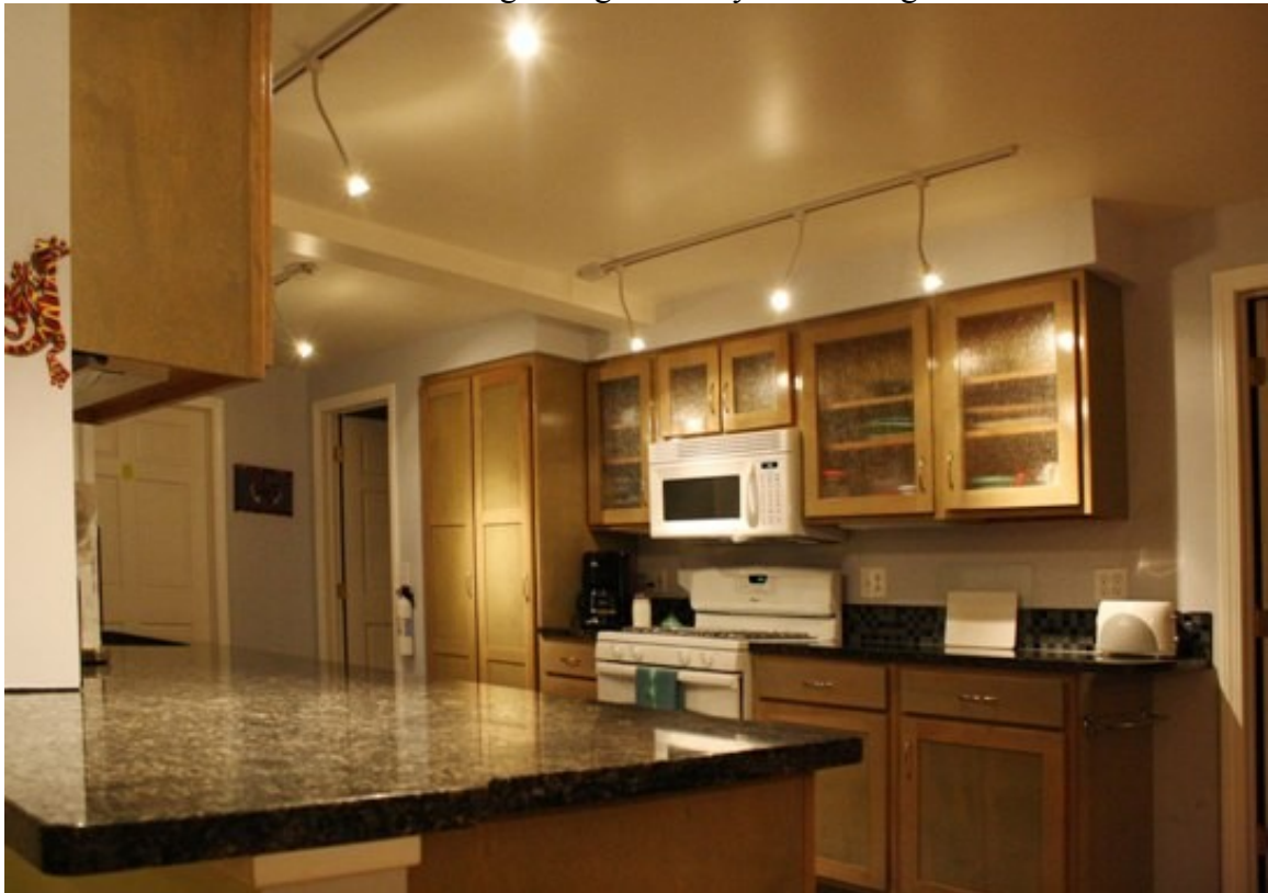
Granite counters and custom-built cabinets