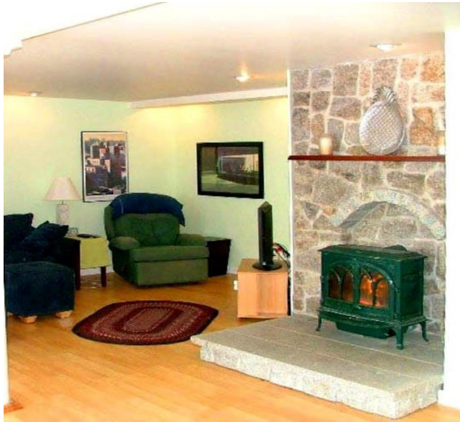
A nice wood fire to come home to