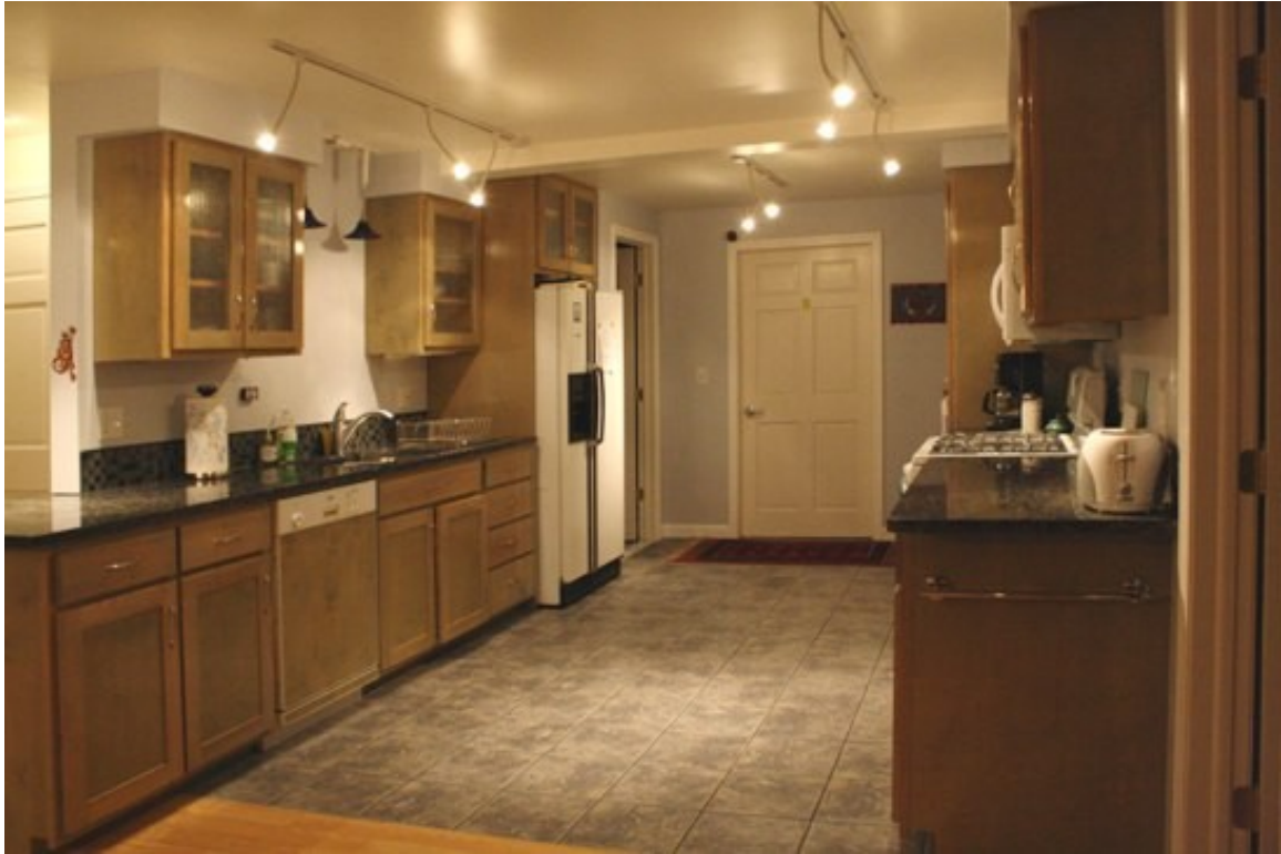
The kitchen is big enough for all your cooking needs