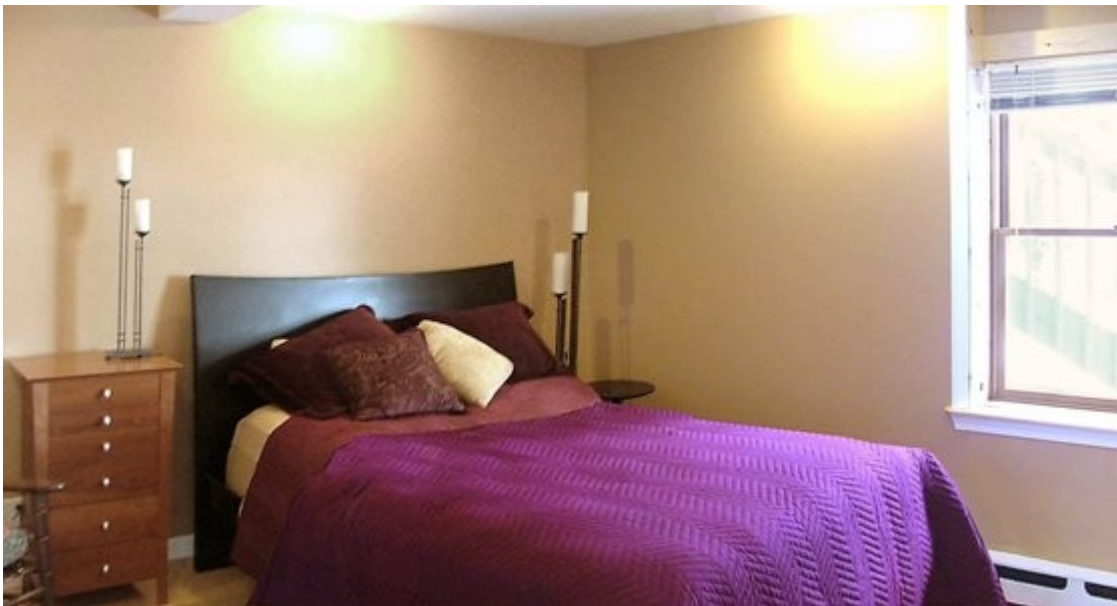
Bedroom one of two--Queen beds in both