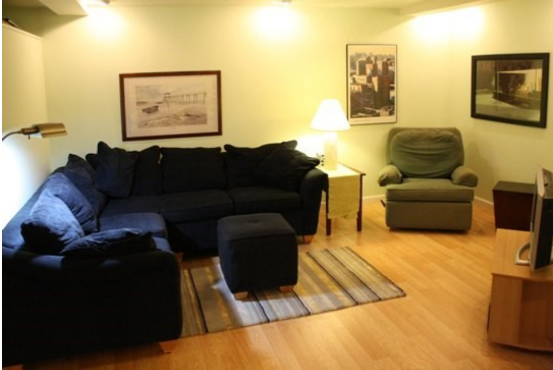
The lounge has a couch, recliner and flat screen TV