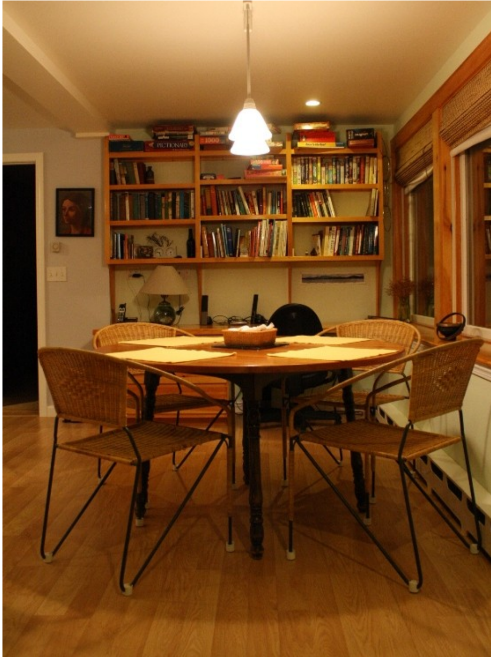
What's for dinner? Lobster again??