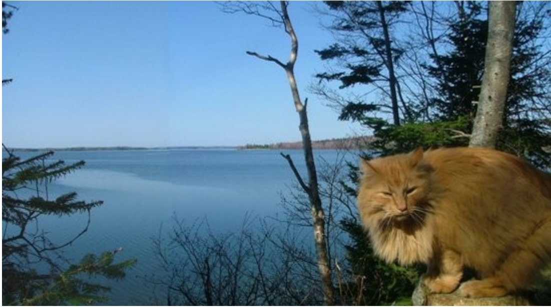
You might see this guy out your windows