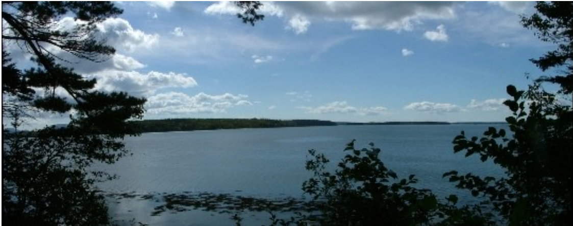
View from the bluff.

SeaCat's Rest is a 900 square foot (85 square meters) two bedroom apartment with full kitchen and bath. The lounge area has seating for 7 and Dish Network satellite TV with DVD and VCR player. The common area features a 32 foot window wall towards the ocean opposite a fire-view woodstove. The kitchen is full size with large fridge, gas stove with oven, dishwasher, coffee maker and grinder and a full selection of utensils. Some basic condiments and spices are provided. Broadband wireless internet is free of charge. A bookshelf with an eclectic selection of fiction, non-fiction, games and movies sits above a desk with drawers full of area activity ideas. A washer and dryer are located in the separate utility area. The owners need access to this area for occasional maintenance but not for laundry. Outside there is a picnic table with gas grill, fire pit and seating area. About 75 feet away is a bluff overlooking Frenchman Bay and Mt. Desert Island beyond. A stairway leads to the rocky shore. Parking is 100 feet away.